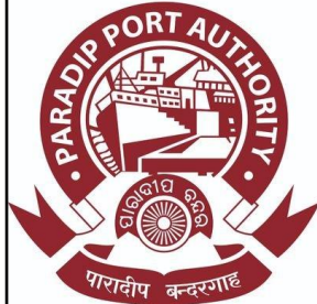
PARADIP PORT AUTHORITY