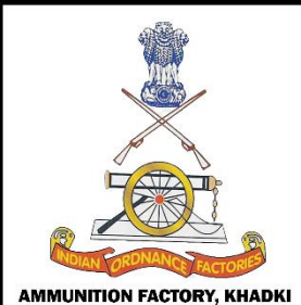
AMMUNITION FACTORY, KHADKI