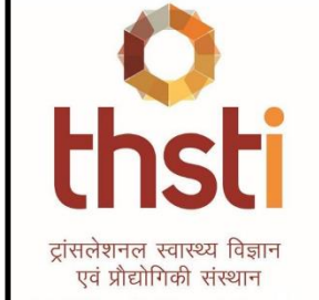
thsti ट्रांसलेशनल स्वास्थ्य विज्ञान एवं प्रौद्योगिकी संस्थान