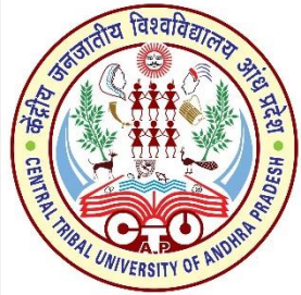
CENTRAL TRIBAL UNIVERSITY OF ANDHRA PRADESH