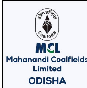
MCL Mahanandi Coalfields Limited ODISHA